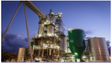
Klabin stabilizes its pulp mill production with Neles solution