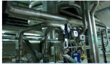
Neles valve expertise secures Naantali power plant's reliability