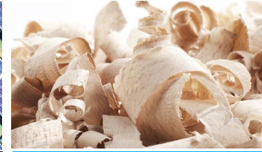
Recycling of wood waste in Vantaa, Finland

In 2020, we produced 2,086 t less CO 2 than in 2019 (2,560 tCO 2 ), equaling 7,134 roundtrip flights Helsinki, Finland to Munich, Germany