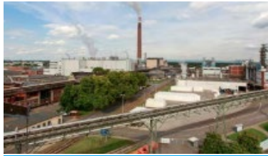
SCA pulp and paper plant sets new standards