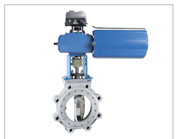
Wafer-Sphere butterfly valve