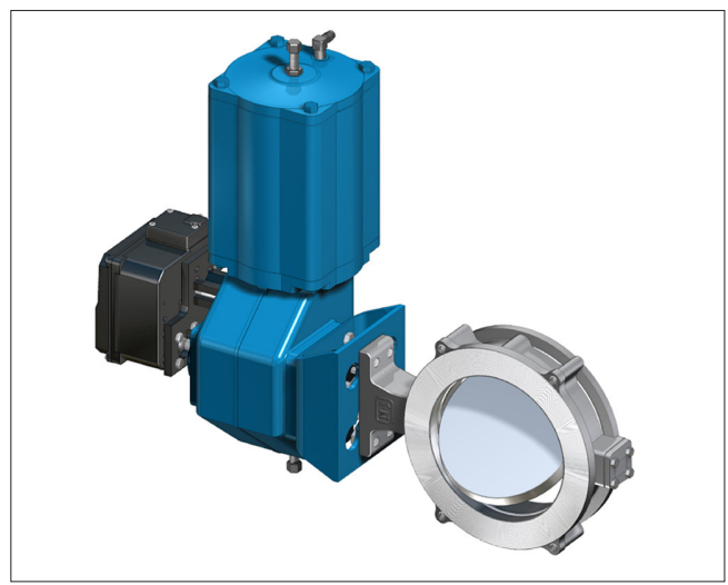
Neldisc triple eccentric disc valve