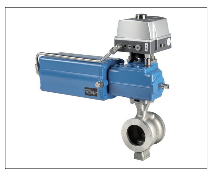
R series V-port segment valve

We have the capabilities of supplying all the valves on these tissue paper machine steam and condensate systems. The metal seated valve lines of ball valve type MBV (flanged) or segment valve type RA-series (wafer) are available with or without Q-Trim. RB (flanged) is preferred for all steam and condensate metal seated butterflies L12 and LW-series and soft seated Wafer-Sphere™ 815, 830 -series are suitable for steam as they are excellent in shut-off service.