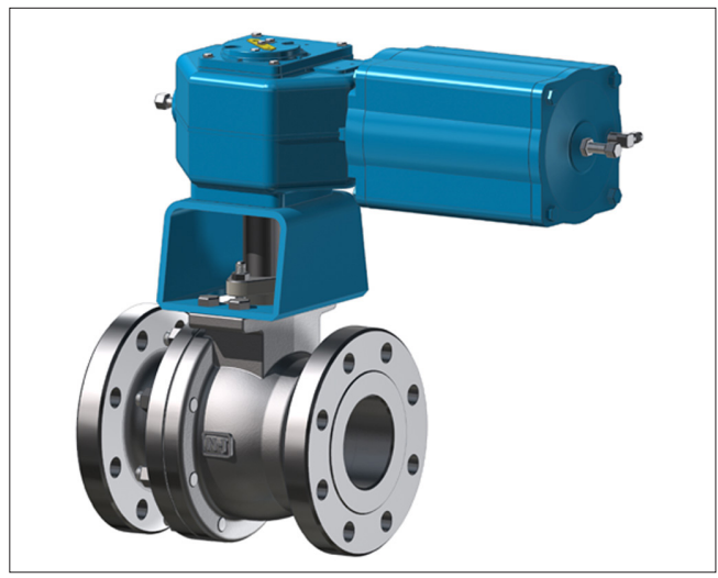
M series ball valve