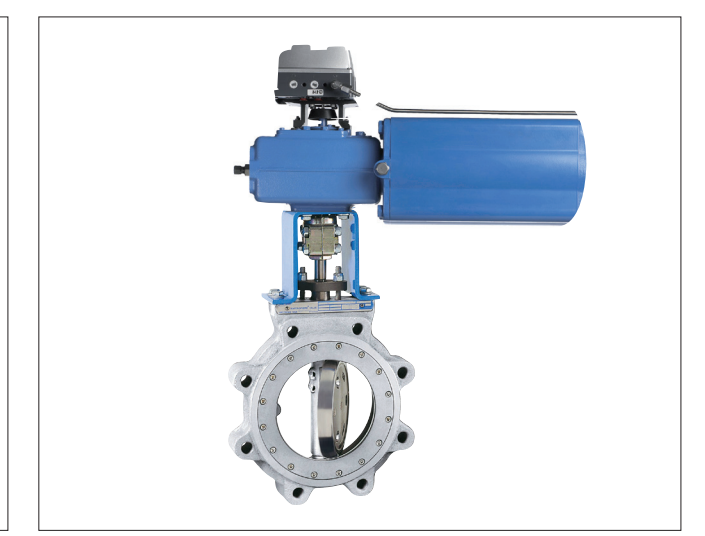
Wafer-Sphere butterfly valve