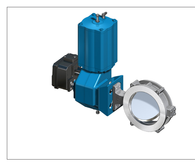
Neldisc butterfly valve